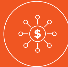
PAID SOCIAL MEDIA