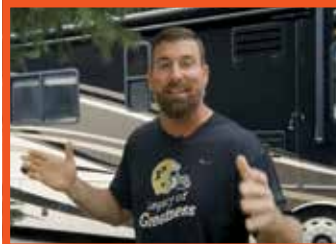
Setting Up at the Campground