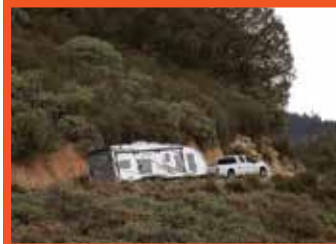
How to Tow