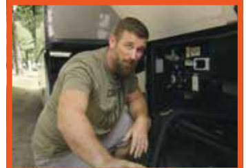
How to Empty the Blackwater Tank

Our goal is to continue to build and expand first-time resources in the coming year to retain the new owners and help them to feel comfortable with their choice.