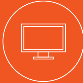
CABLE AND STREAMING TV