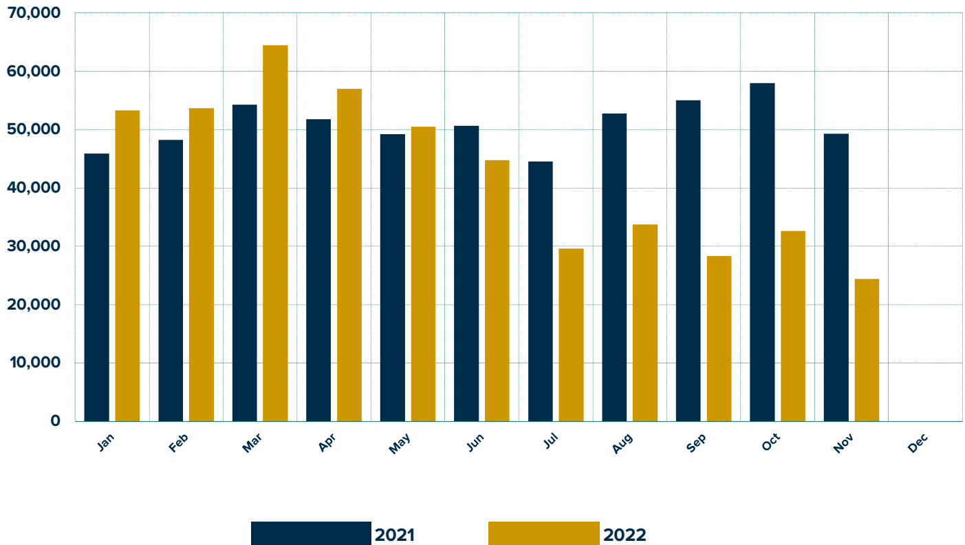
Total Shipments Monthly vs. Last Year